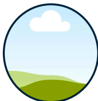
Dr. Muhammad Wahdan Omran Business Incubator