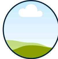
National Organization For Potable Water and Sanitary Drainage "NOPWASD"